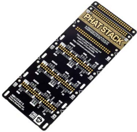
PCB Only /PIM320