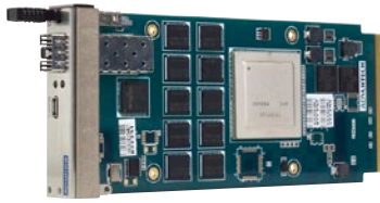
Figure 2: Advantech AMC-4201 AdvancedMC™ board featuring the QorIQ P4080 processor