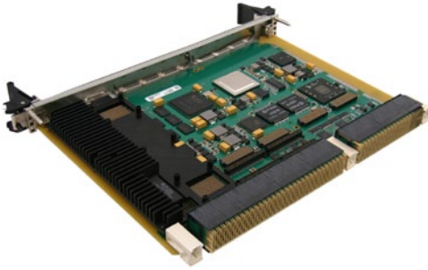
Figure 3: Curtiss Wright VPX6-187 based on the QorIQ P4080 processor

In addition, Freescale is an active member of standards committees that support this industry, such as Power.org™, RapidIO® Trade Association, PICMG® and The Multicore Association™. These standards bodies work with other industry participants to provide specifications that allow for richer and more cost-effective market solution. Freescale's participation allows for a broad ecosystem that enables Freescale technologies and products. To ease the “make vs. buy” decision, Freescale is providing a series of development systems that include a COM Express compatible module on a carrier card. These systems aid in software development and provide access to the processor, built on Power Architecture® technology. The orderable part numbers for the Freescale development systems are: